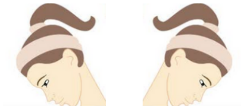
LEFT and RIGHT Head Down