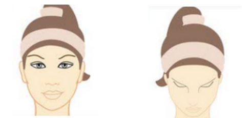
FRONT Eyes Forward and Head Down