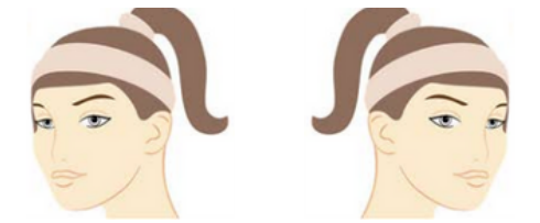
LEFT and RIGHT at 45° ANGLE Eyes Forward