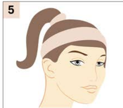
5 Right 45° Angle