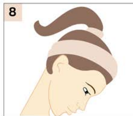
8 Right Side Head Down