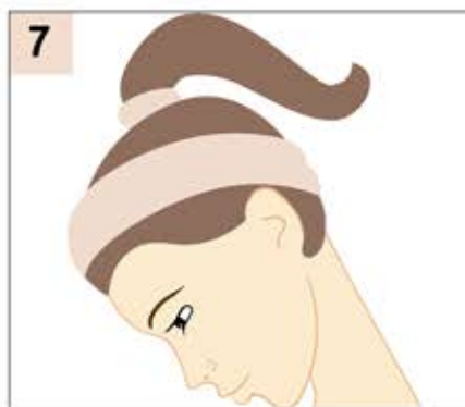
7 Left Side Head Down