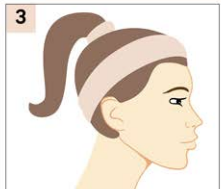
3 Right Side