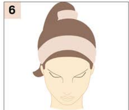
6 Full Front Head Down