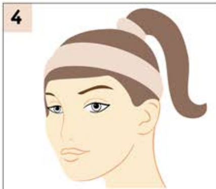
4 Right 45° Angle